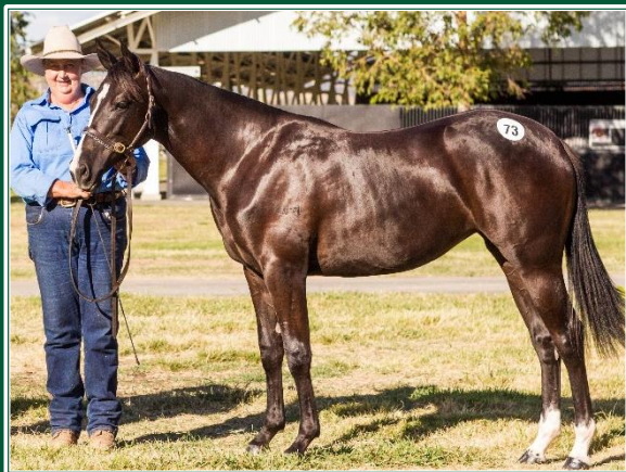
SHEADY JUBILATION ..... $13,000