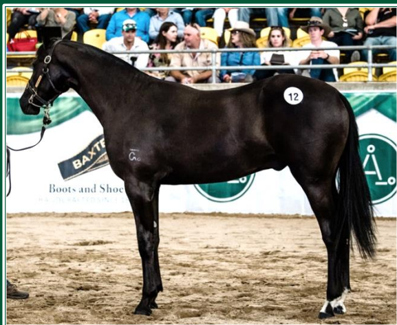
BULLSEYE CEASAR - HSH ..... $7,000