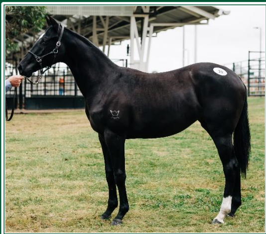
ROYALLE HEART STRINGS ..... $15,000