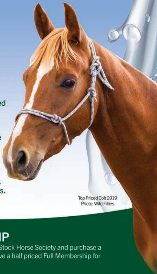
Top Priced Colt 2019

Prizes for Highest Placed FOY Sale Horse also available throughout the ASHS National Show, including exclusive classes for FOY Sale Horses.