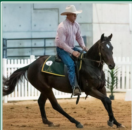
BARNETTS IN STYLE - HSH ..... $12,000