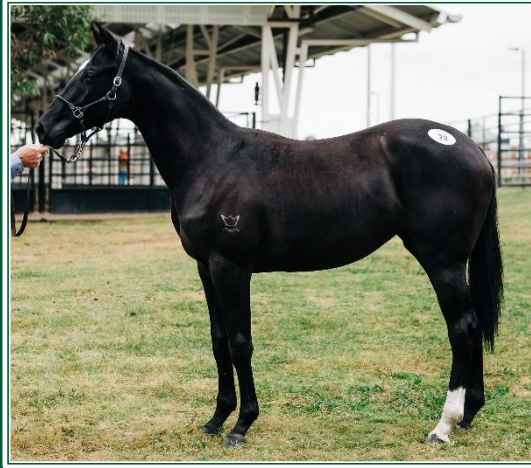
ROYALLE HEART STRINGS ..... $15,000