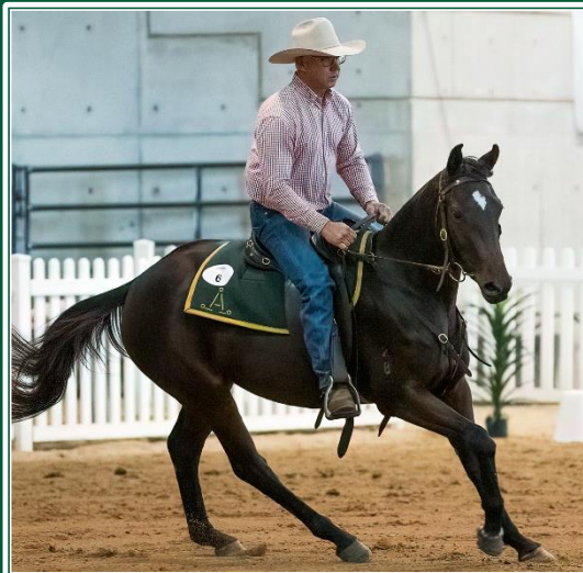
BARNETTS IN STYLE - HSH ..... $12,000